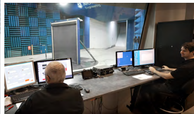
8 feet x 8 feet Zipscreen after withstanding 87 mph.

*The Zipscreen shade used X-Weave 5% fabric and was side fixed to a timber substrate secured with 12G fasteners. Inner rails were secured with 8G fasteners as per the Zipscreen Installation Manual guidelines. Each wind speed test was held for a minimum of 60 seconds. 'Maximum achievable wind speed' refers to the limitations of the testing facility, and not the Zipscreen system.